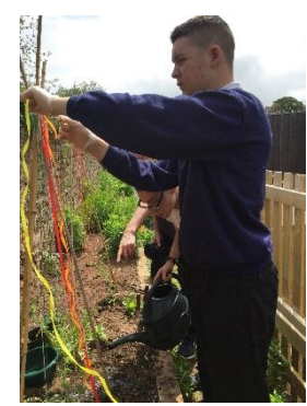
Class 12 have been planting and harvesting beautiful flowers as part of their rural enterprise and gardening!