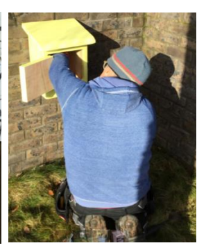
We had a visit from the Sensory Trust on Friday, who have installed a gorgeous set of boxes to create a Sensory Trail within the school grounds. They have also given us more wellies and waterproofs, so we can all make the most of the wet and muddy days!