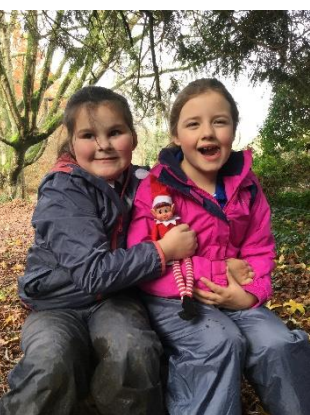
And Class 3 made the most of the outdoors when they went on a hunt to find Jingle the elf. They all worked really well together to find him and bring him safely back to school.