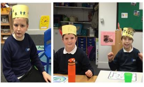
Big thumbs up to our Class 10 catering team!